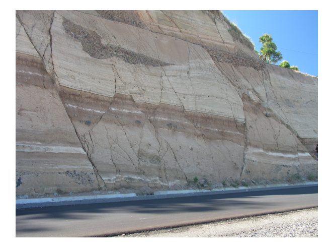
Figure 1: Normal faults in volcanic ashes and paleo-soils, El Salvador

Numerical modelling is a key tool to better understand, assess and control these processes. They couple the flow and energy transport along the faults and in the surrounding porous